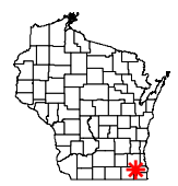
Project Location in Wisconsin

Map Date: March 5, 2019 AMS Filename: Waterford_DASH_2018.mxd